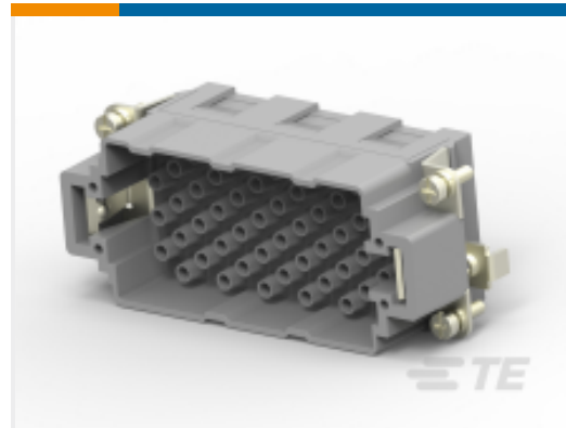
TE Part # T2050482101-007 HEEE-048-M