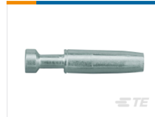
TE Part # T2030002040-000 CEF-4.0