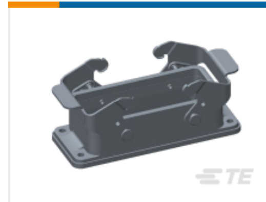
TE Part # T1410162000-000 H16B-AG