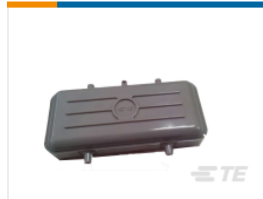
TE Part # T1010162100-000 H16B-KDBP